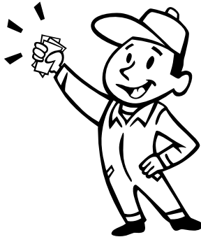
Plumber C offers the lowest price

Differentiation contributes to brand expectation.