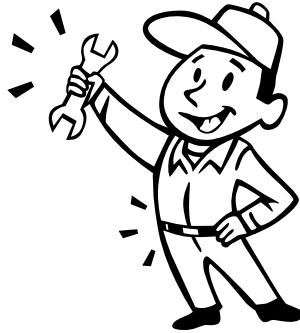
Plumber A always arrives looking great